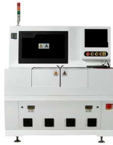
Genitec 20µm PCB Laser Cutting Machine for SMT ZMLS5000DP