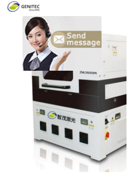
Genitec FPC PCB Laser Cutting Machine With State Cooling System