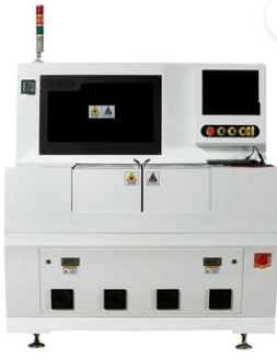
Genitec Single Phase AC220V PCB Laser Cutting Machine for SMT...