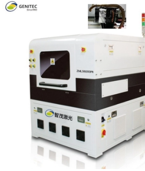
Genitec NS Laser PCB Laser Cutting Machine FPC/PCB Cutting Machine for SMT...