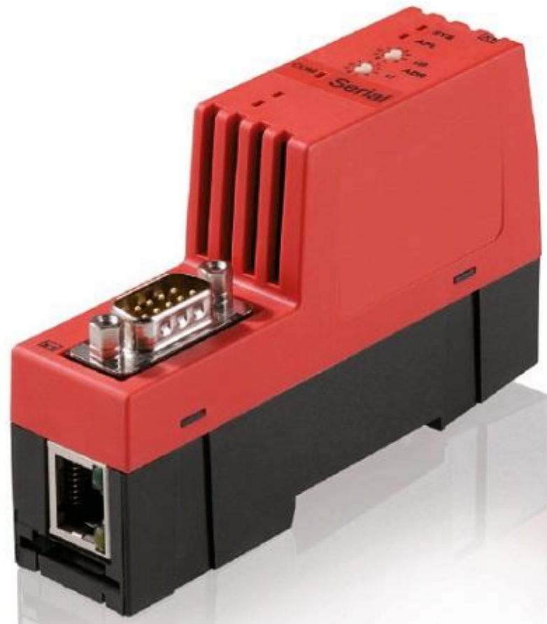
netTAP 50 Profinet gateway