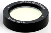
Air Spaced Zero Orde...