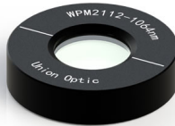
(/multi-order-waveplate/en.html) Multi Order Waveplat...