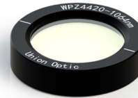
(/air-spaced-zero-order-waveplate/en.html) Air Spaced Zero Orde...