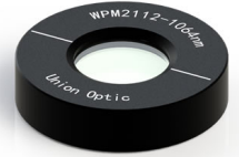
Multi Order Waveplat...