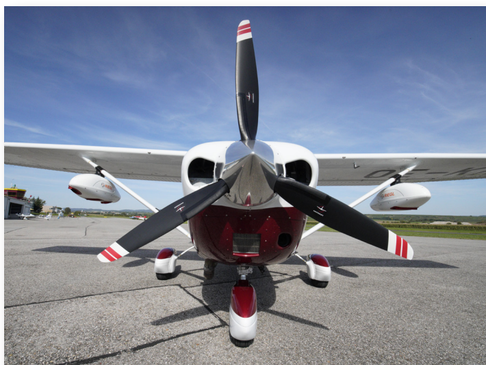
RIEGL's Cessna T206H test plane equipped with two VQX-1 wing pods