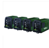
PLASMA TABLES TOOLING & ACCESSORIES