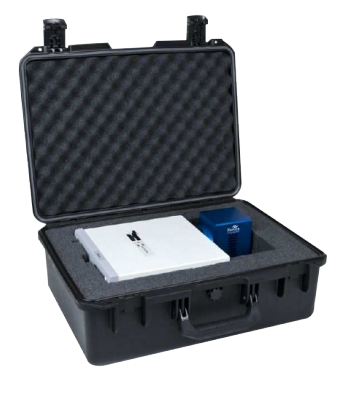
MPX-2 in Carrying Case (Optional)