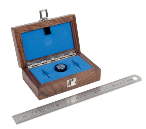
MPX Geometrical Calibration Artefact (Optional)