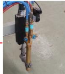
Flame Cutting Torch