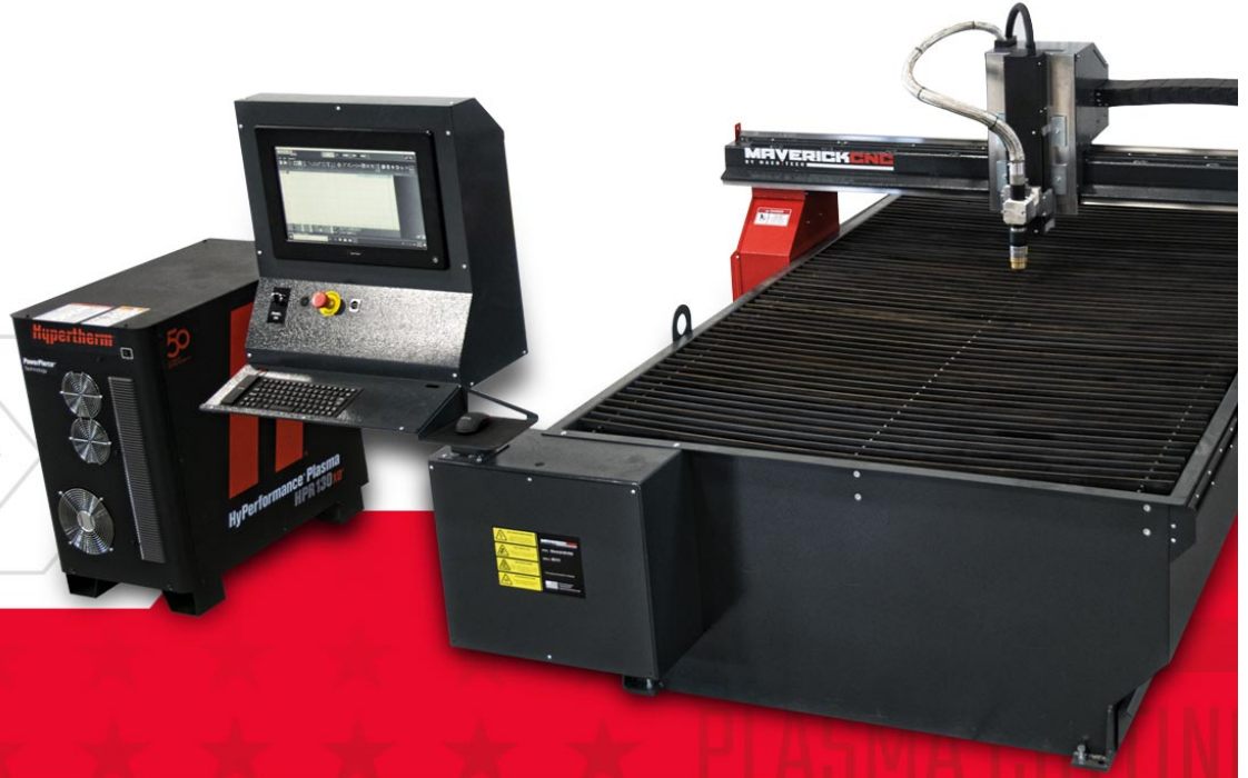
TABLE SIZES 5' x 10' ▶ 6' x 12'