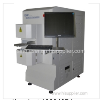
(/product-1389407-Laser-Laser-Wire Stripping machine Wire-Stripping-machine.html) (/product-1389407-Laser-Wire-