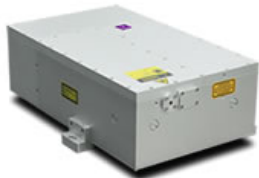
5/10/15W UV 355nm laser