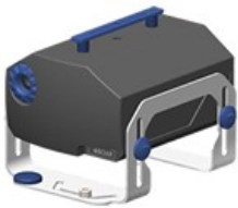
Ultrafast FROG Autocorrelator