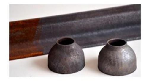
Carbon steel descaling