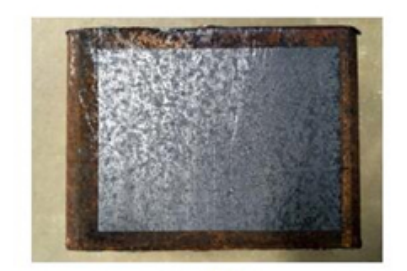
Surface rust removal