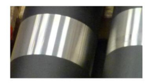
Steel pipe paint removal