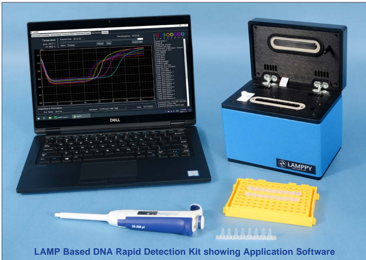
LAMP Based DNA Rapid Detection Kit showing Application Software

be tested are first mixed with a solution of primers, enzymes, an intercalating dye, and several other components. This mixture is then dispensed into standard 0.1 mL PCR tubes with flat caps, commonly known as low-profile PCR tubes. Acceptable sample volumes can be between 5–125 µL (10–30 µL recommended). OZ Optics does not provide the reagents/kits to carry out the reaction. Instead, we collaborate with companies who make these reagent/kits for specific applications and pathogens. The instrument can work with many different solution kits for different pathogens. For that reason we consider it to be a universal DNA/RNA detection system.