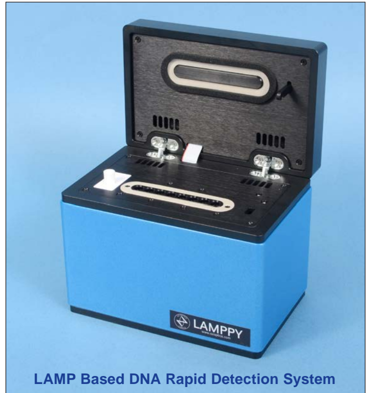
Clinical trial: LAMPPY™ vs. leading brand qPCR machine

OZ Optics offers an exceptionally affordable yet reliable optical DNA detection system based on isothermal techniques such as Loop-mediated Isothermal Amplification (LAMP). Much like polymerase chain reaction (PCR) amplification, LAMP is a highly sensitive method of DNA detection that creates billions of copies of a target DNA from a minute amount of sample RNA or DNA. However, unlike PCR, LAMP applies an isothermal process that does not require expensive and complex equipment, nor time consuming thermal cycling. It is a more cost-effective and rapid system. LAMP is especially ideal for rapid diagnosis of pathogens or infectious diseases, with results usually within 30 minutes and for high viral loads less than 20 minutes. The LAMPPY™ system uses an array of high powered LEDs, photodiodes and filters for real-time quantitative detection. The system can be paired with an external battery for a compact, field-deployable diagnostic instrument. Samples to