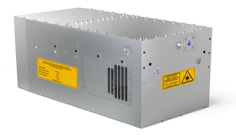
Figure 1: Lampo laser head including driving electronics and air cooling fans.

Bright Solutions is glad to introduce Lampo , the new family of compact ultrafast lasers generating high peak power ps laser pulses at a repetition rate selectable over a wide frequency range, externally triggerable from 50 kHz to 4 MHz.