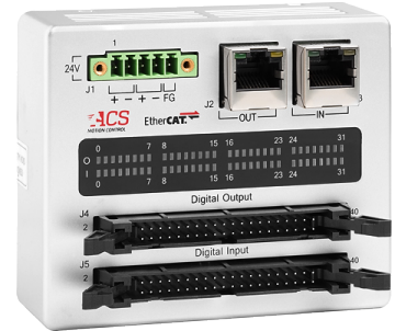
Digital In/Out ED1616N0 ED3232N0