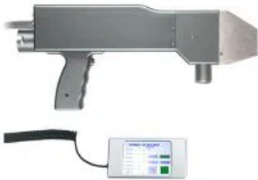
Portable Metal Surface Laser Cleaner System