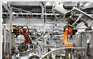
Car body construction