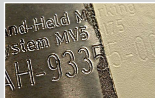
Sand-blasted and coated