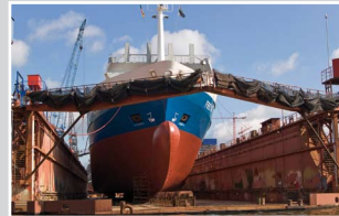
Ship building industry