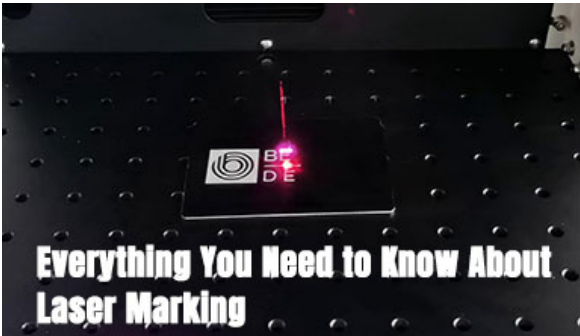
Everything You Need to Know About Laser Mar...