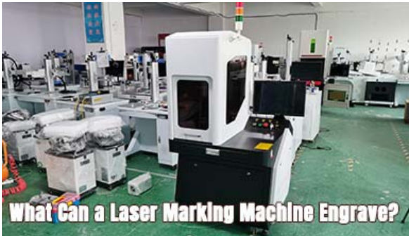
What Can a Laser Marking Machine Engrave? – ...

In looking into options for a 30W fully enclosed fiber laser for our company, Eagle Tech met our needs and exceeded expectations. In working with a new manufacturer we had concerns, but communication and customer service were consistent throughout our tim