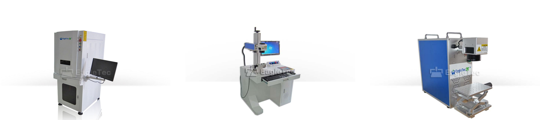
Enclosed 30W Fiber Laser Marking M... Model.ET-FL30C; 30W; 8"x8" Size; Full Protection; Better Filtering Smoke