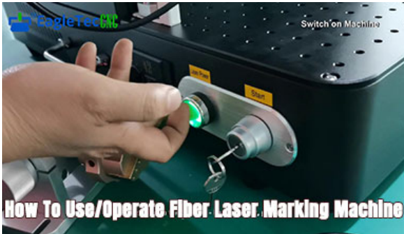
How To Use/Operate Fiber Laser Marking Mach...