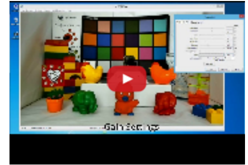
Getting Started with See3CAM_CU135