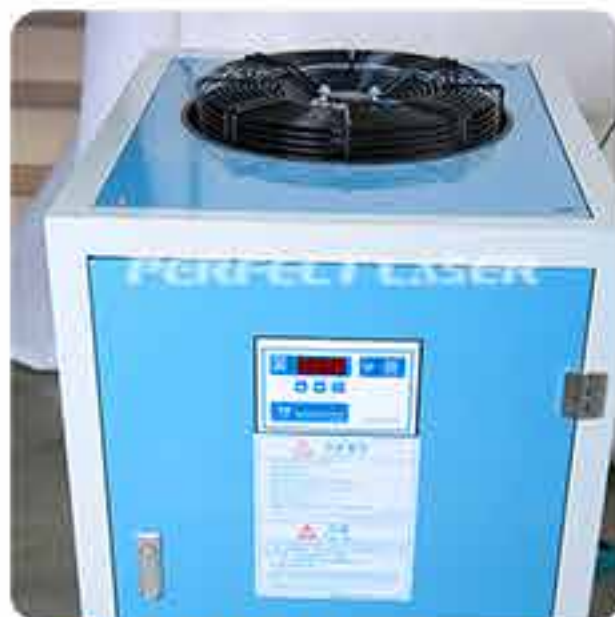
7P Water Chiller