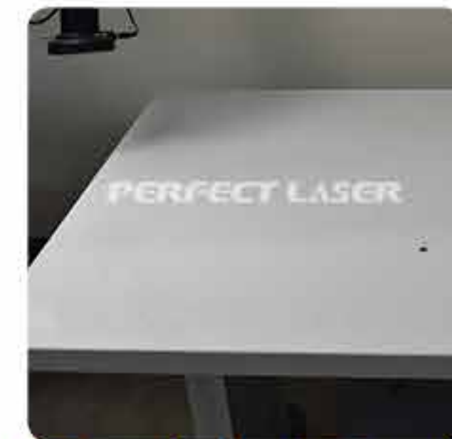
Marble Work Table