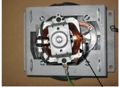
"Infinity" Brush Motor