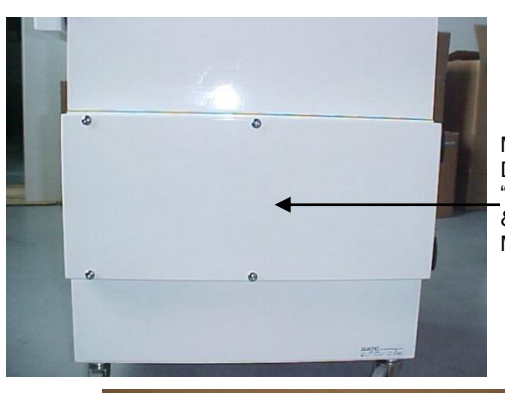
Motor Access Door For "Quick Change" & "Infinity" Brush Motors

REMOVE ALL FILTERS BEFORE TURNING THE UNIT OVER TO ACCESS THE MOTORS.