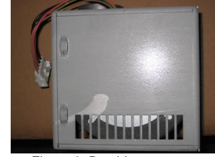
Figure 3: Brushless