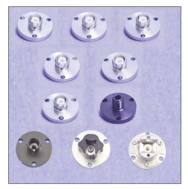
Bulkhead receptacles for ultra, super, or angled connectors with or without stoppers

Sleevethru adapters are use to mate two male connectors together. The flange on the receptacle enables the user to mount the adapter onto a housing or box. Our standard receptacles mate fibers terminated with industry standard FC/PC, FC/APC, SMA, SC, LC, and ST connectors. Universal connectors allow one to mate together fibers with difference connector types, as long as they are polished the same way.