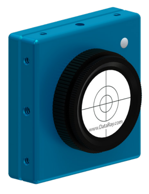
BladeCam2-XHR/HR 46x46x13 mm

The BladeCam2<sup>™</sup> is paired with DataRay's full featured, highly customizable, user-centric software which has no license fees, unlimited installations, and free software updates. It is perfect for applications including: CW laser profiling; field servicing of laser systems; optical assembly; instrument alignment; beam wander and logging; R&D; OEM integration; quality control; and M<sup>2</sup> measurement with available M2DU stage.