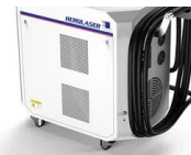
Handheld Portable Laser Rust Remov...