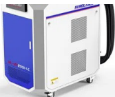
Laser Cleaner for Rust Removing Machine