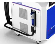
Rust Removing Laser Cleaning Machine