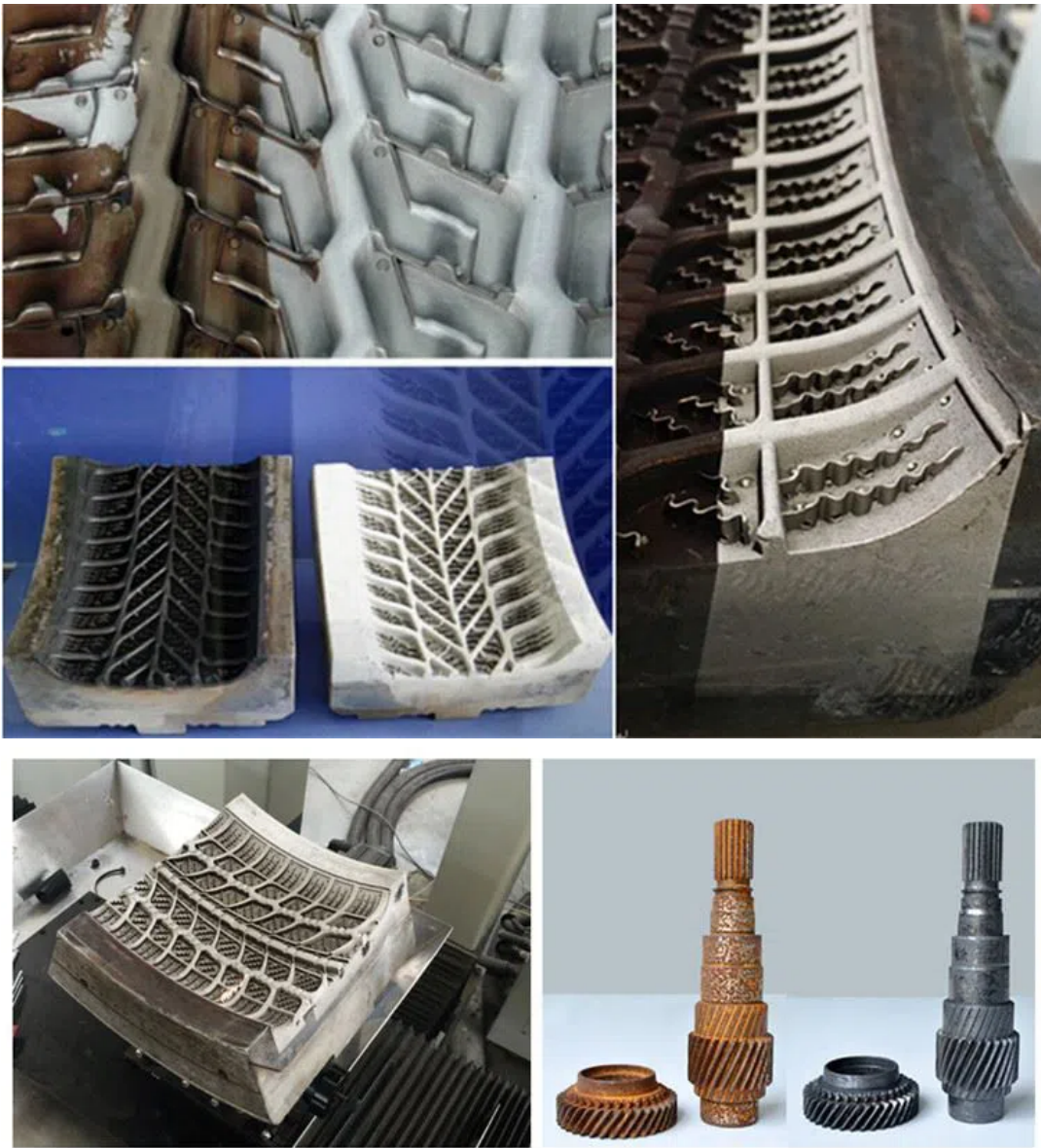
6. Pictures of Hero Laser