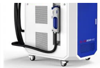
High Power Rust Remover Laser...