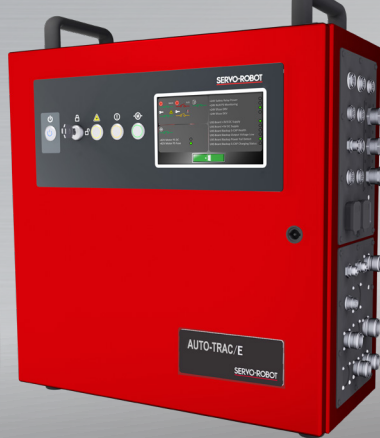
THE ALL NEW AUTO-TRAC/E™ CONTROL UNIT