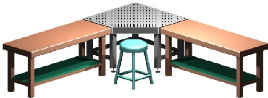
Standard lab counter

used to clean the finish. The core is a damped nonmetallic honeycomb with inherent broadband energy absorption. The 1" grid of holes (also available with no grid) are sealed with a polymeric film that punctures when the hole is used, allowing the full depth of the core to be utilized. Any spills into an open hole would be easily removed with a stiff tip syringe.