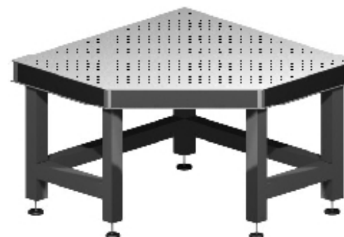
48"x48" Corner Table