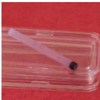
Cr:YAG/Nd:YAG Fused Rod