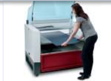
Pass-through for bulky materials