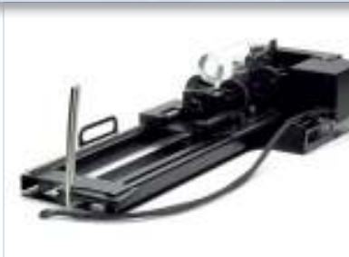
Rotary attachment for bottles or glasses

Trotec filter systems are automatically controlled via JobControl®. For example, you can turn the filter on before the start of engraving or at the end of engraving to optimise the removal of dust and fumes. The system provides dynamic feedback on turbine activity and filter saturation.