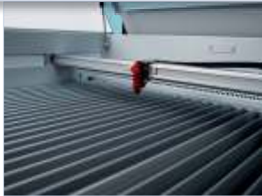
Cutting table with aluminium lamellas for reflection-free cutting