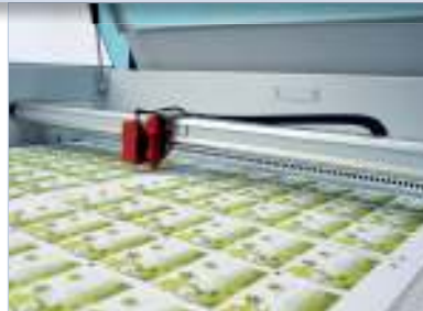
Vision system i-cut