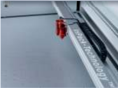
Vacuum table for thin and light materials

The innovative design enables the table to be configured to suit any cutting and engraving application, and makes switching between laser applications faster than ever. Simply attach the right table for your application (no tools required). The Speedy 400 comes with the following standard table configurations: magnetic engraving table, vacuum table, cutting table (lamellas) or black aluminium grid-table.