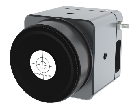
TaperCamD-LCM 2.25 x 2.25 x 2.13"