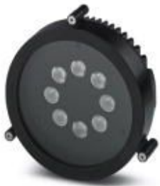
Signal light, 24 V DC, red, communication interface, safe diagnostics in accordance with safety standards

Please be informed that the data shown in this PDF Document is generated from our Online Catalog. Please find the complete data in the user's documentation. Our General Terms of Use for Downloads are valid ( http://phoenixcontact.com/download )