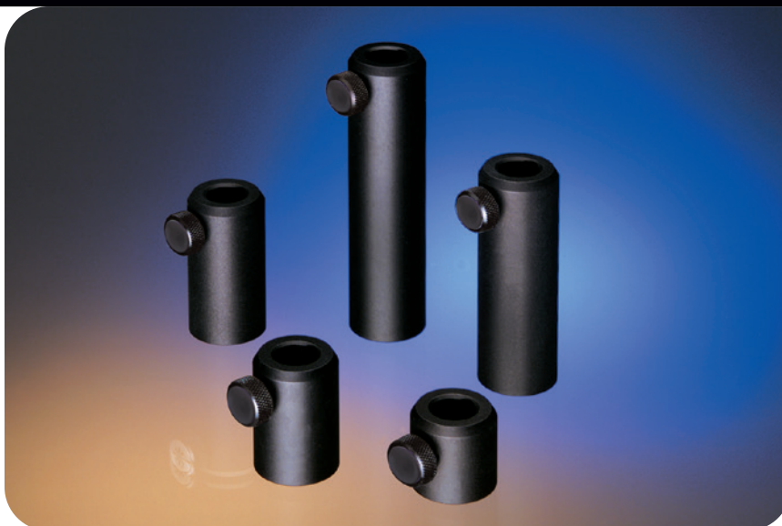
Half-inch Post Holder