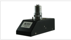
Optics Module with 5 MP Color Camera