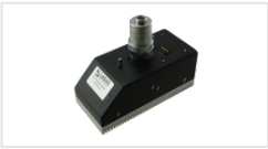
Optics Module EPI- BLUE Fluorescence with 5 MP Camera