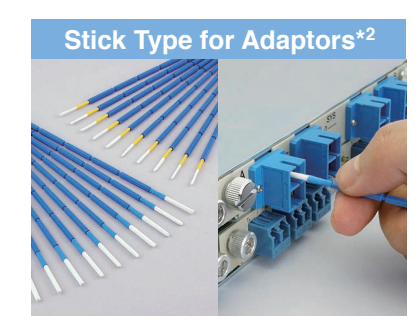
*1: For ferrule end face cleaning in plugs. *2: For ferrule end face cleaning in adaptors