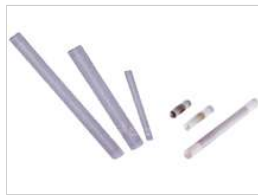
Continuous-groove, Concave-surface and Diffusion-bonding