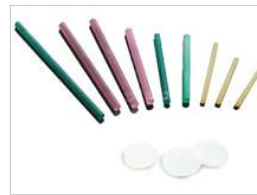
Nd:Ce:YAG, Yb:YAG, Er:YAG, Cr:Tm:Ho:YAG