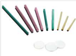
Nd:Ce:YAG, Yb:YAG, Er:YAG, Cr:Tm:Ho:YAG