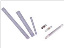
Continuous-groove, Concave-surface and Diffusion-bonding