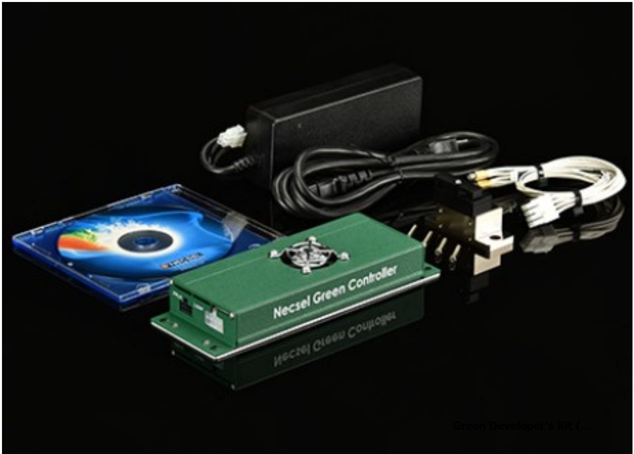
Green Developer's Kit (GDK)