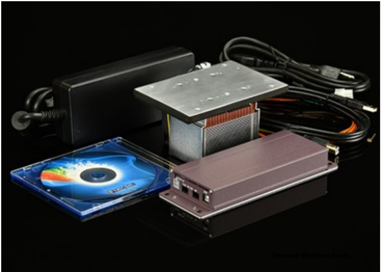
Thermal Platform Device