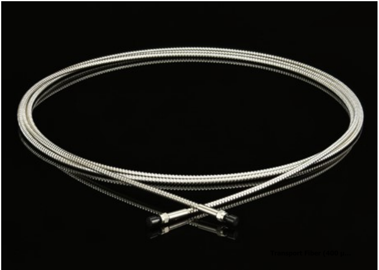
Transport Fiber (400 μm)