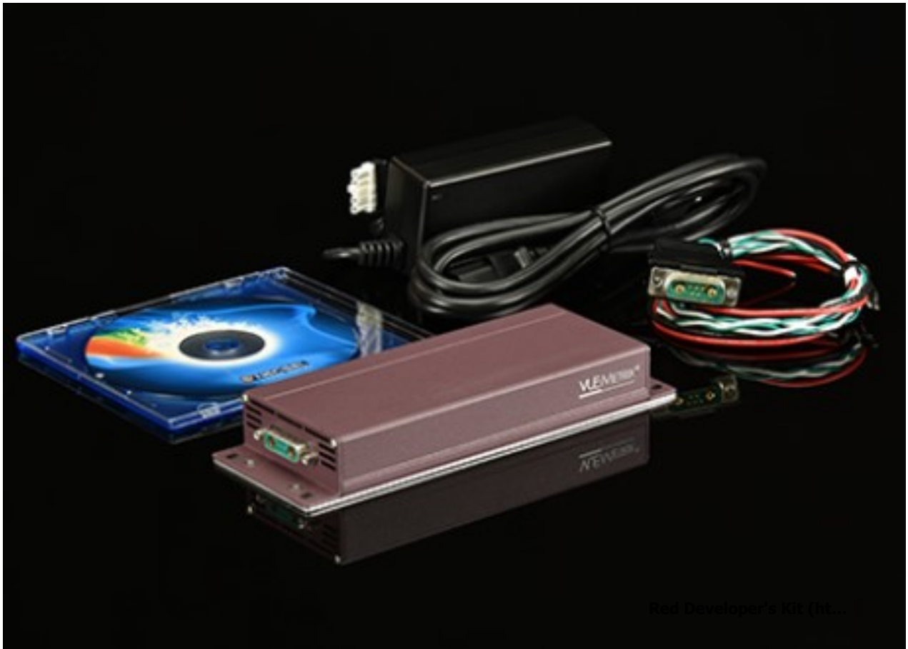
Red Developer's Kit (RL)