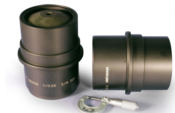
High NA objective lenses

Some of our most demanding lenses for semiconductor