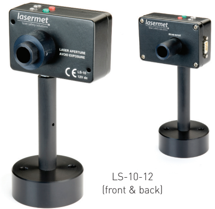
LS-10-12 (front & back)

12 VDC outputs are available from the shutter to power remote LEDs indicating shutter status.