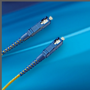
SC/SC Simplex Single Mode

Single Mode simplex fiber cable, 9/125 μm, 2.0 mm jacket, standard connector, riser grade. Rugged version available.