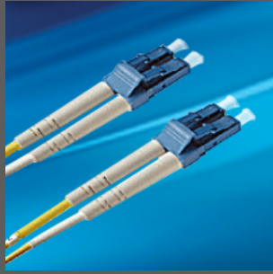
LC/LC Single Mode Duplex