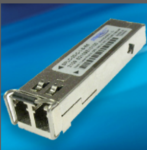
SFF Duplex Transceiver

We stock high quality optical transceivers from only the best manufacturers. Our optical engineers will be glad to help you pick the correct model for your applications.