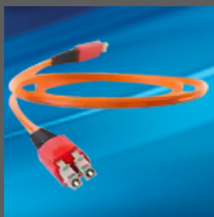
Ruggedized Fiber Cable