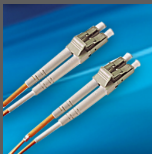
LC/LC Duplex Fiber Cable Multimode