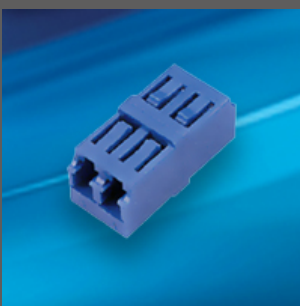
LC to LC Duplex Fiber Adapter