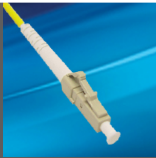
LC/LC Simplex Multimode