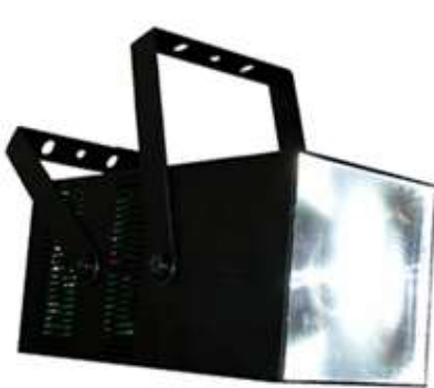
HOLORED-it! POWER LED lighting 50W : HLP50 type

HOLORED-it! POWER 50W : HLP50 type (Production Orders)