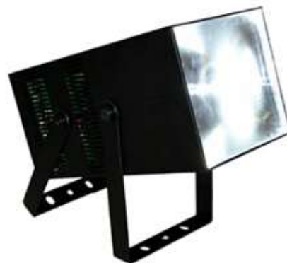
standing and rotating

Power consumption : 約50W Directional characteristic : 3 to 10 degree External control : PWM input, DMX512 input(option) Size : width 102mm × height 102mm × depth 220mm Weight : about 1,300g with AC adapter