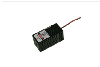
High Power 532nm Laser Module (with TEC Control)