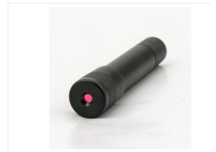
Red Laser Sight Hunting Rifle Dr Scope