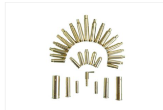
Cartridge Red Dot Laser Training Bullet