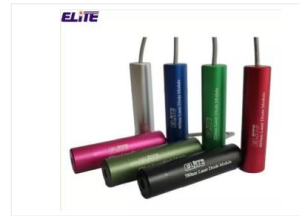
Focus Adjustable Laser Module: