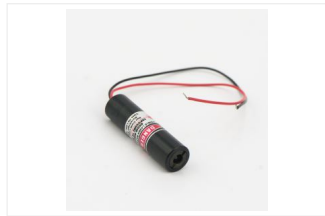
Uniform Line Module

Hot Tags: high power butterfly fiber coupled laser module, China, factory, suppliers, manufacturers, wholesale, customized, quotation, buy, bulk, free sample