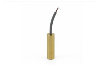
520nm 532nm Green Mini Laser Diode Module