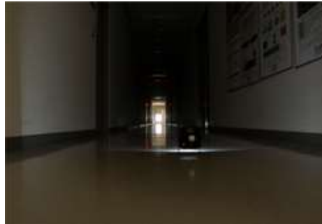
Distance lighting with telecentric type

HOLORER-it! Telecentric lighting, only 1m square narrow area at the distance of 50m away, can be possible by high quality large diffraction optics. HOLORER-it! can adjust the angle of the illumination region and spread. We have a wide variety of HOLORER-it! LED lightings such as ultraviolet light - visible light - infrared light.