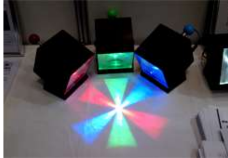
Visualizing the light diffusion