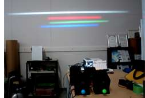
Straight line lighting