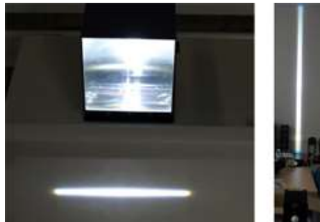
Straight line lighting nearby and distance.