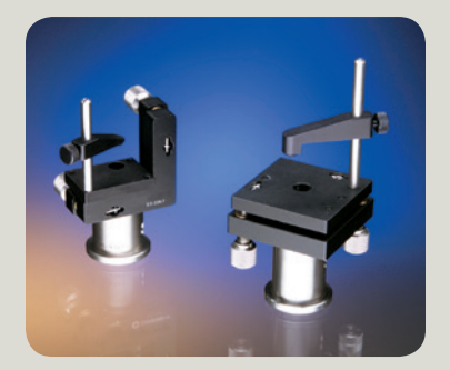
Kinematic Prism Platforms are also available on page 94.