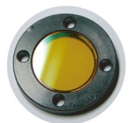
Dust Prevention Window