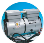
Air Compressor Unit