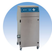
Fume Extraction System