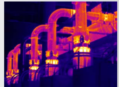
MultiSharp Focus, available on the Ti450 PRO and Ti480 PRO