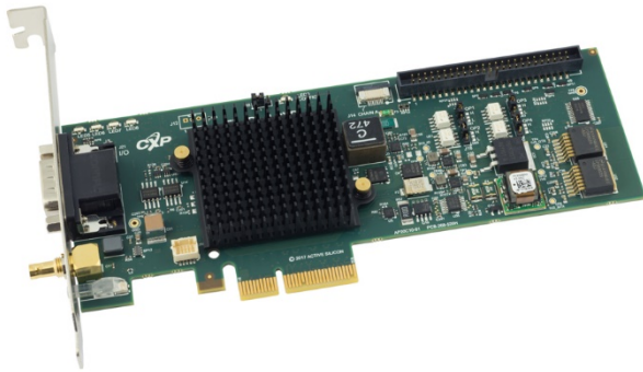
With full height bracket

The FireBird Single CXP-6 Low Profile can be purchased with either a full height PC card bracket for use in regular PCs or with a low profile PC card bracket to fit into small embedded PC enclosures and 2U rack mount cases.