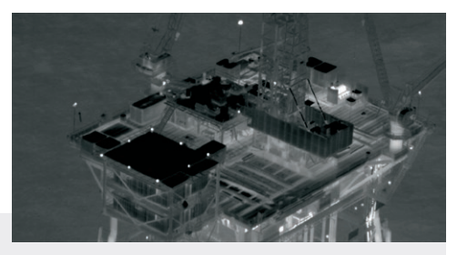
FLIR VALUE AND REPUTATION The performance, reliability and support expected from FLIR