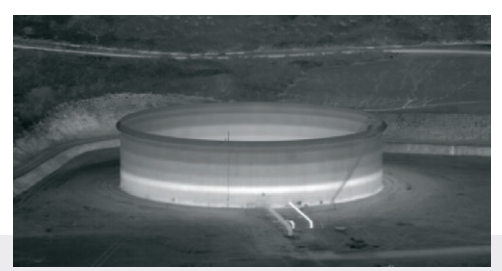
DESIGNED FOR INTEGRATORS Simplify development and shorten time to market

The >1.3 megapixels provide crisp imagery for a small instantaneous field of view (IFOV) at longer standoff distances while maintaining a wide field of view (FOV)