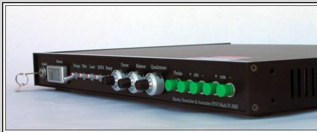
The Latest Mark IV-3000

Now Even Better with Extremely Pure Laser <2 kHz linewidth and Near-Zero Phase Noise Velocity Resolution Down to 0.003 m/s EDFA to Amplify Return Light