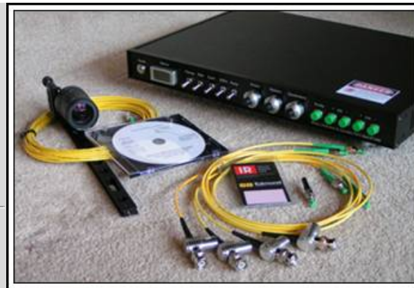
FDVI Mark IV 3000 - Complete System

Full Quadrature and Push-Pull Changeable Delay Leg Length Experiment Viewing Probe Photodiode Modules Verification of Proper System Operation Multiple Channel Systems Component Specifications: FDVI Mark IV-3000 Component Specifications: FDVI Mark IV FDVI System Prices