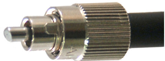
Figure 3: Setup for coupling into the FC/B ® connector end using the FC/B ® holder

All statements and technical information related to the products herein are based upon information believed to be reliable or accurate. However, IRflex assumes no responsibility for any inaccuracies. Users assume all risks and liability whatsoever in connection with the use of a product or its application. IRflex reserves the right to change at any time without notice the design or specifications of its products described herein. (Version: 201810)