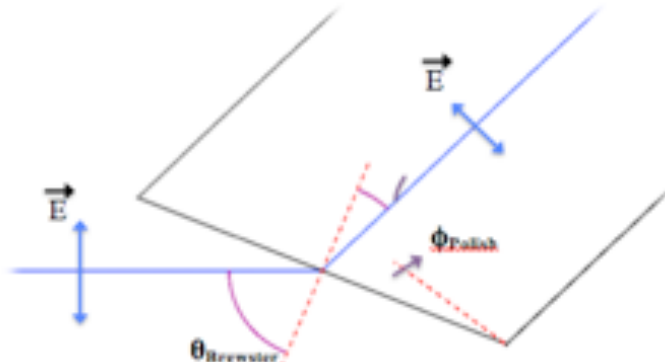
Figure 2: Diagram showing the input beam polarization for maximum transmission. Additionally the relevant angles are shown

IRflex's FC/B ® connector is polished at a predetermined angle that permits the incident light to arrive at the Brewster angle when used in conjunction with the custom-made FC/B ® holder. Normally, light incident at the Brewster angle will be transmitted at an angle with respect to the surface normal, and this angle is not along the fiber's axis that allows the incident beam to escape to the cladding and not be guided. FC/B ® 's polish angle, together with the holder, allows the input beam to be incident at the Brewster angle and be transmitted along the axis of the fiber to achieve a successful coupling. The FC/B only works well at the input side. FC/B at the output side is not guaranteed to work, as the fiber does not preserve polarization state. For nearly full transmission at the input, the beam needs to be in the TM or P-polarization state, as seen in Figure 2.